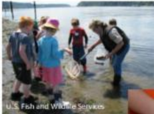
U.S. Fish and Wildlife Services