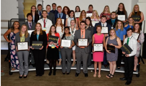
2018 State Award winners in the senior division with their plaques.

outstanding knowledge and life-skill development. State award applications are divided into four categories: Mark of Excellence essay contest (11-12 years old), junior state award (13-15 years old), senior state award (16-19 years old) and group awards (13-19 years old). The application process and selection is determined by the age of the 4-H member.