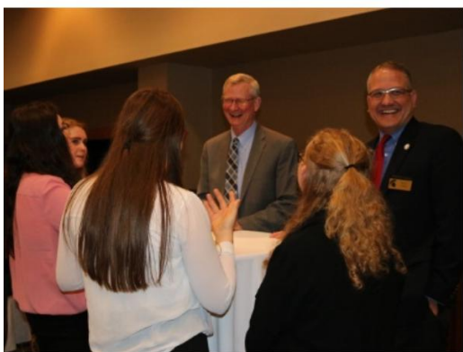
2018 Capitol Experience participants interacting with resource people.

4-H Capitol Experience is now recruiting for 2019 participants! This annual statewide program, occurring March 17-20, helps prepare youth for active citizenship by focusing on civic engagement and public policy.